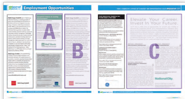
SAMPLE PRINT CLASSIFIED PAGES/AD SIZES

A color company logo is included in insertion price, any additional color in your classified ad is subject to a $125 color charge. All advertising rates are subject to change.